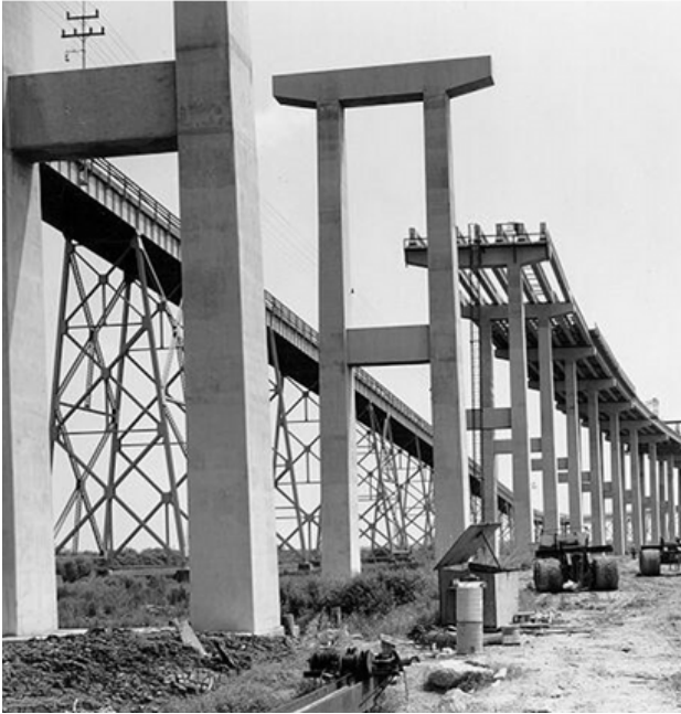
Construction of Silas N. Pearman Bridge in 1965 beside the Grace Memorial Bridge Charleston, South Carolina