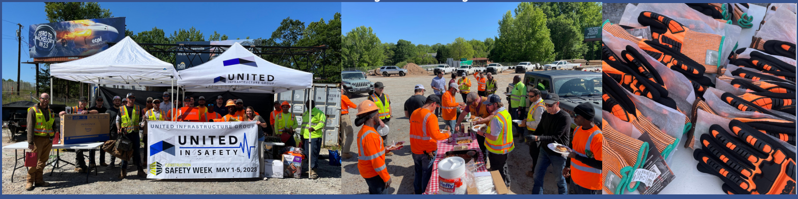
Greenville Safety Lunch