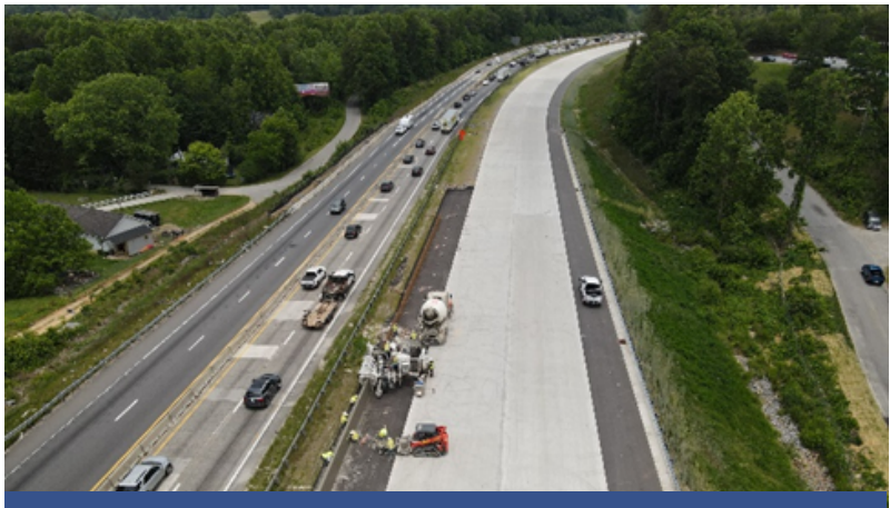
Median Barrier Wall Slipping North of Airport Rd.

Upcoming Milestones: Phase 3 Traffic shift to place traffic on New WB at the end of June. Girder Installation on French Broad River Bridge