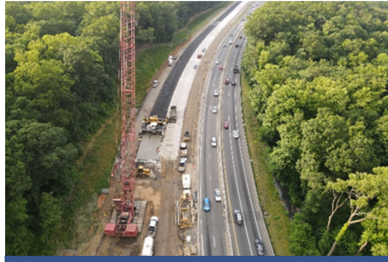
Installation of PCCP up to Blue Ridge Parkway Bridge