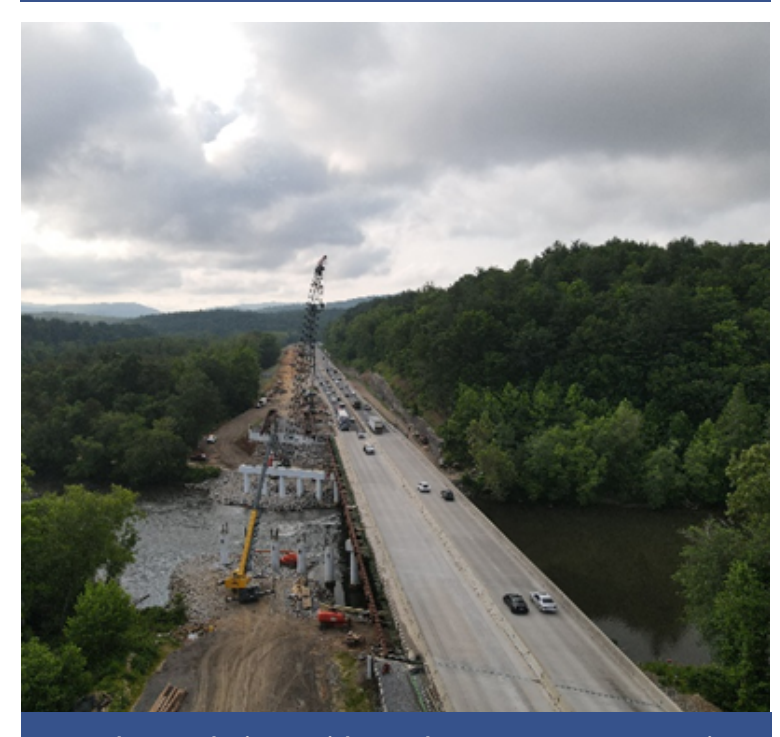
French Broad River Bridge Sub Structure Construction